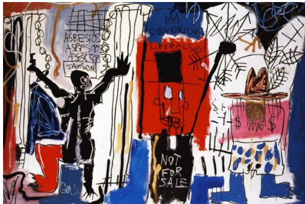
Obnoxious Liberals (1982)