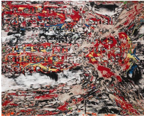
Amendment #8 (2014)