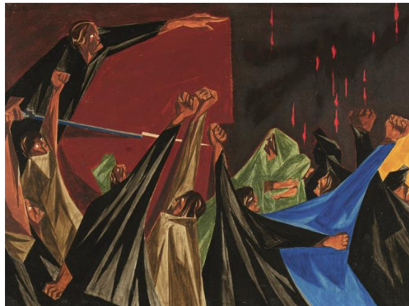
Struggle: From the History of the American People, Panel 1 (1955)