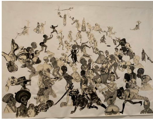
Christ's Entry into Journalism (2017)